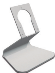
SOB-UNI Desktop adaptor