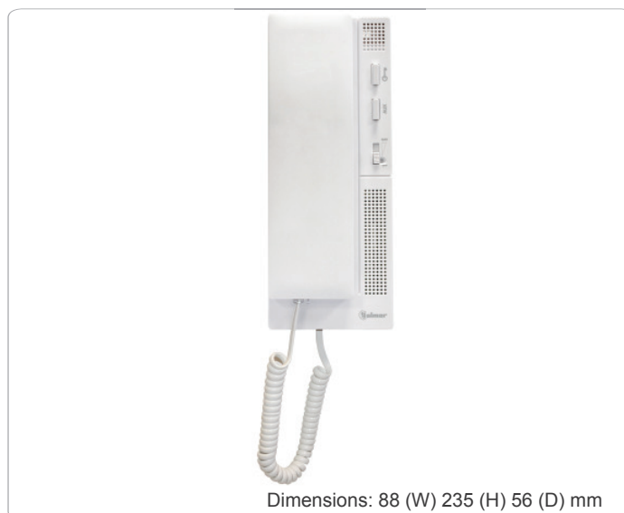
Dimensions: 88 (W) 235 (H) 56 (D) mm

V2Plus is a 2 wires audio and video BUS. The BUS is not polarized what makes V2Plus an easy-to-install system.